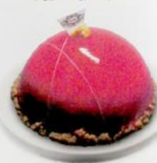
火焰红葡萄袋 FLAMING RASPBERRY 部色射神寺目的红荷果酱、包裹着genoist 法式海绵蜜糕, 让你尝到自巧克力帮壮 及資大利红葡奶茶。(500克/$36)