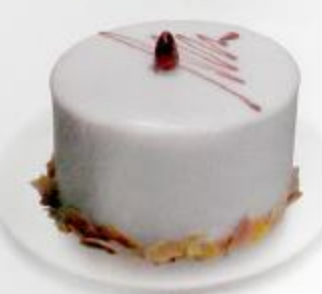
象牙塔的梦想 IVORY TOWER 充满椰香的genoise运式海纳市村、放光 出香浓的牛乳糖干果味、配搭椰子草包。 姚伽斯结拟的浪漫成人。(500至7536)