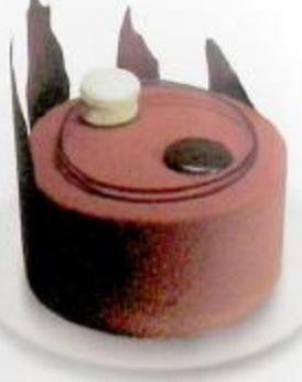
经典据拉米苏 TIRAMISU 经典的意大利提性米苏蛋糕。融合着高 大利mascarpone乳糖基性,三维酒、衍 兰地酒和咖啡香。(500克($38)