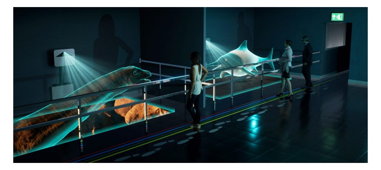
As well as going into hologram tunnels, the guests also go past smaller hologram enclosures with animals that move and act alive.